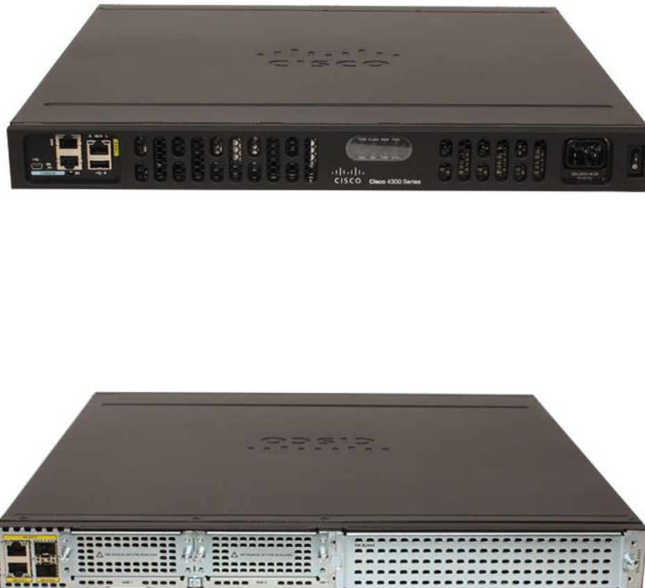
Figure 1. Cisco 4000 Series Integrated Services Routers